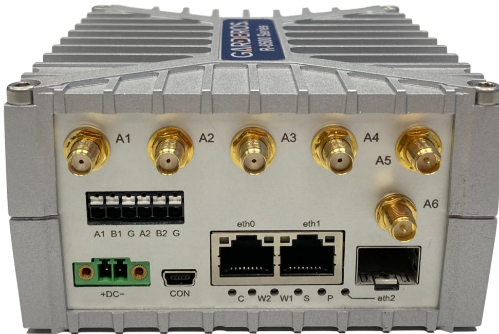
Fig. 1: Garderos R-8500 routers for high throughput and edge computing

Garderos routers provide secure and reliable data connectivity for professional industrial applications in telecommunications, utility networks and intelligent traffic systems. The ruggedized routers of the Garderos R-8500 series have been designed for mobile and stationary applications which require high bandwidth and high processing power.