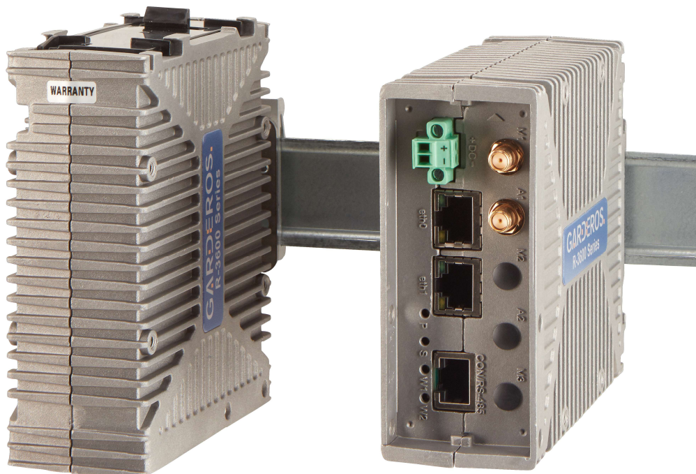
Fig. 1: Garderos R-3600 single radio routers optimized for smart grid.

Garderos routers provide cyber-secure and reliable data connectivity for large-scale router networks in telecommunications and utility networks, as well as intelligent traffic systems. The Garderos R-3600 Series routers provide 2 LAN ports and optional wireless WAN interfaces such as Public Cellular and Private LTE. Failover between a wireless WAN interface and an Ethernet port configured as a WAN port is possible.