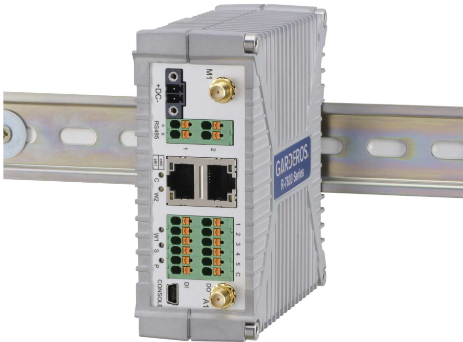
Fig. 1: Garderos R-7600 single radio router optimized for smart grid.

Garderos routers provide cyber-secure and reliable data connectivity for large-scale router networks in telecommunications and utility networks, as well as intelligent traffic systems. The Garderos R-7600 Series routers provide 2 LAN ports and optional wireless WAN interfaces such as Public Cellular and Private LTE. Failover between a wireless WAN interface and an Ethernet port configured as a WAN port is possible. The extended version provides additional I/Os and RS-485 interfaces for integration with systems in secondary substations.